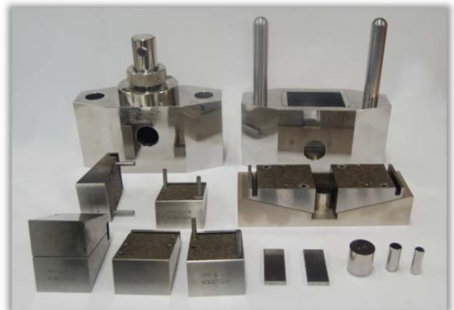
Figure 2: ASTM 3410 IITRI Fixture

The Shear Loading method using the IITRI compression fixture with self-tightening wedge jaws is described in ASTM 3410 it is also referenced in ISO 14126:1999 The IITRI compression fixture (figure 2) works well, however, it is very massive (over 20 kg), difficult to handle, and slow to heat-up and cool-down when testing at temperature.