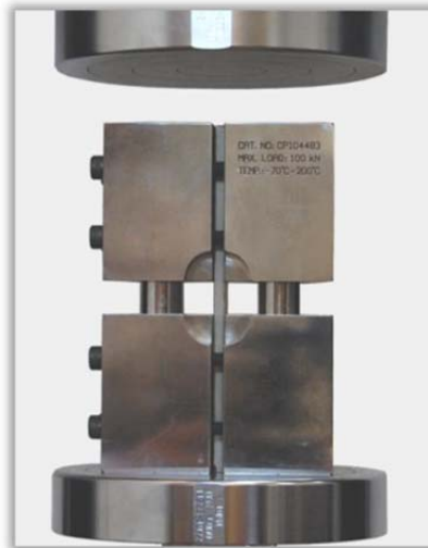
Figure 4: ASTM D CLC Fixture

Combined Loading Compression (CLC) uses a mixture of end and shear loading, in this method the shear stresses are reduced and it is possible to generate the clamping forces using bolted clamps (Figure 4 - ASTM D6641-09 CLC fixture). ASTM D6641-09 defines a method of performing CLC tests on a tabbed specimen with a short unsupported gauge section. Compared to the IITRI fixture, the CLC fixture is much lighter and easy to handle.