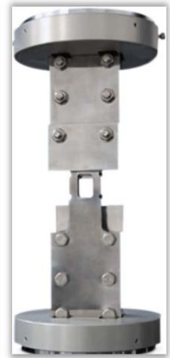
Figure 5: ASTM D6484 OHC Fixture