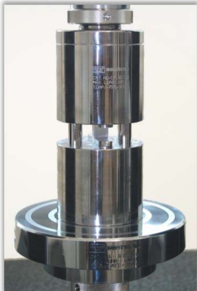
Figure 3: Wyoming Modified Celanese Fixture

A modified so-called “German” version of the Celanese fixture with jaw faces sitting in a flat wedge pocket which also ensures full surface contact between the jaws and the mating cavity is referenced in prEN 2850:1997. The Celanese type fixtures are much lighter than the IITRI fixture and easier to handle.